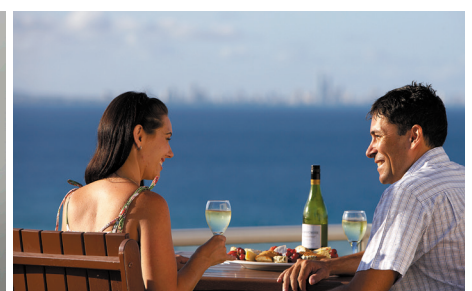
Roof Top of Kirra Beach Resort